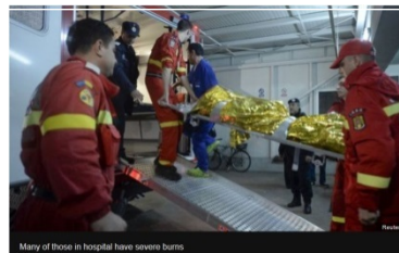
Many of those in hospital have severe burns